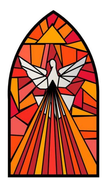
Together We Pray

For the children who died in residential schools throughout Canada and for all those who continue on a journey through the darkness, that there may be healing founded on truth and that the Spirit will inspire our ongoing commitment to reconciliation.