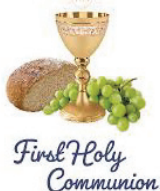
First Holy Communion

All families who have formally registered in the preparation process will participate in a parent child catechetical meeting. The second and final opportunity to attend this essential meeting is Monday, February 3 rd from 7:00 p.m. to 8:15 p.m. Please note only the parent(s) and the child preparing for the sacrament is to attend.